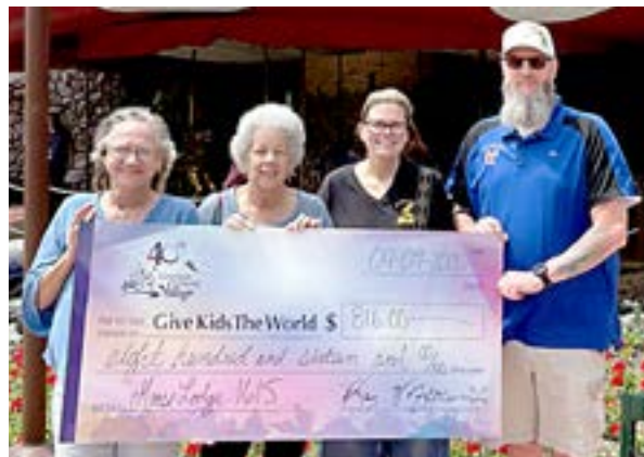
Members from South Lake Moose made a special donation presentation at Give Kids the World, a check for $810.