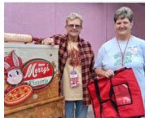
FMA volunteers for The Bakery (aka "Cookie Cart") and Merry's Pizzeria (aka "Food Delivery") worked in the evening hours at Give Kids the World.