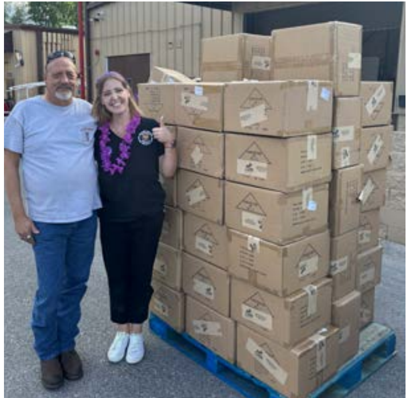
FMA Moose Riders delivered the cases of Tommy Moose for the Heart of the Community Committee.